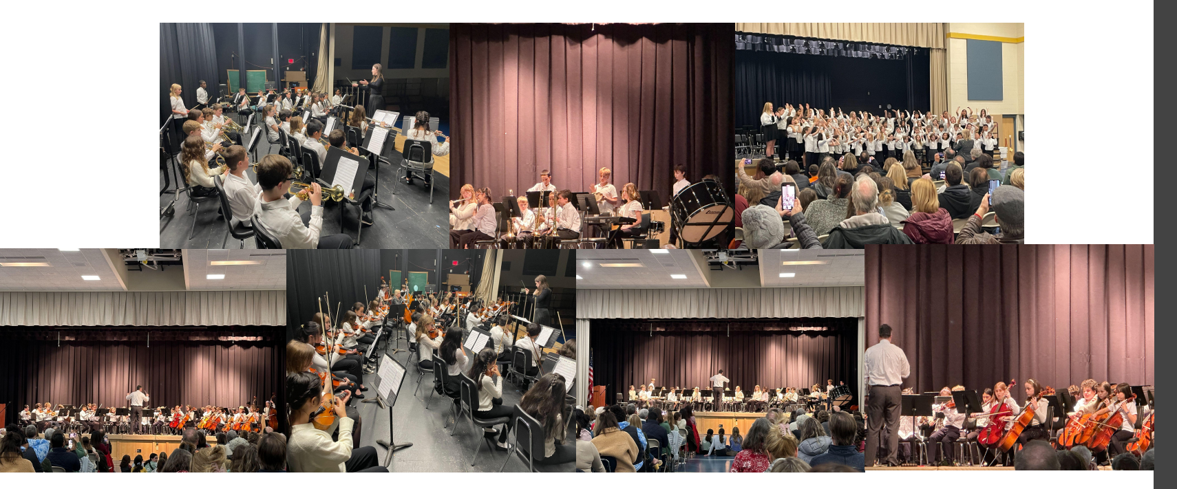
SRS Winter Concert will be held on January 25th at 7pm